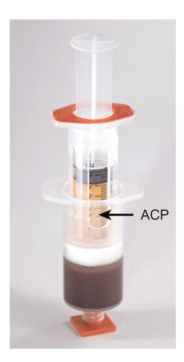
Figure 2. Image of syringe components with blood separated into the leukocyte-rich red blood cell pack and final injection syringe containing autologous conditioned plasma (ACP).

In a feasibility trial, the safety of a medical product concerns the medical risk to the subject, which is usually